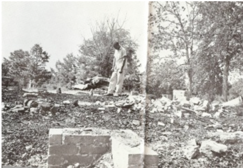
The Mount Zion Methodist Church, June 1964

This is my personal story of my journey to Neshoba County, what I saw, and what I learned there.